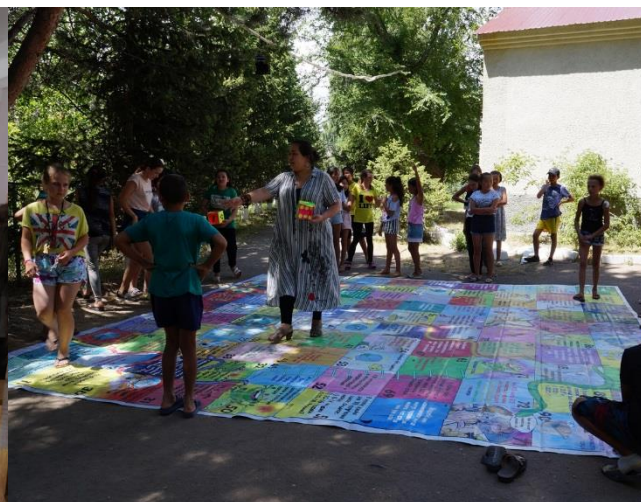
Children summer camp “Dzherzhinets”, 500 children