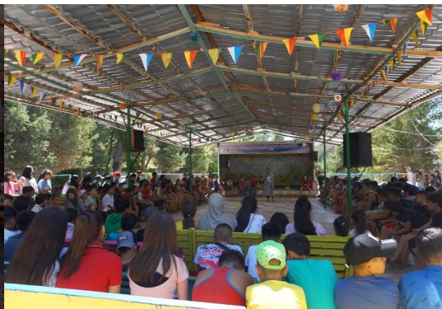
Children summer camp “Kelechek”, 480 children