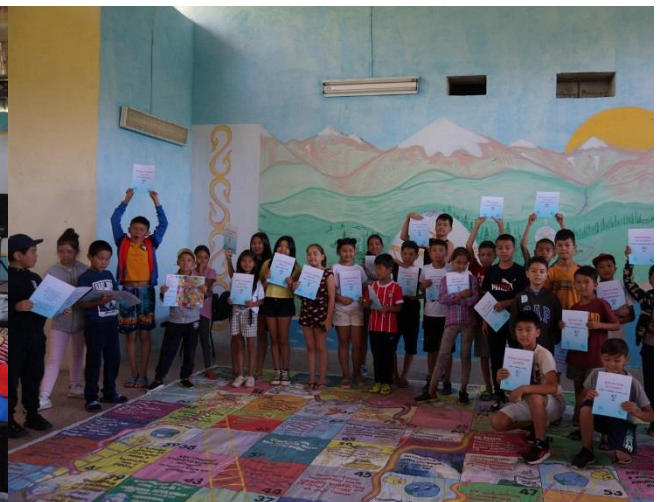
Children summer camp “Mayak”, 350 children