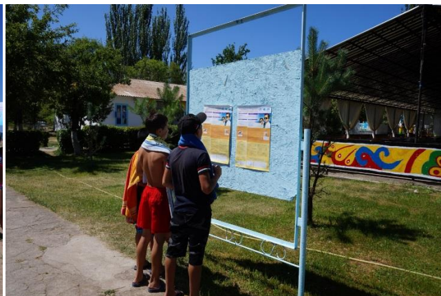
1) Children summer camp “Orlenok”, 200 children