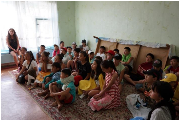
Children summer camp “Ulan”, number of children 300.

The agenda included short lecture about the ozone layer and UV radiation, watching the educational movie “Protection from UV radiation”, demonstration of poster “Safety is on the first place” and comics book “17 steps to better future”, playing ground game Ozzy Ozone and quiz. Comics book “17 steps to better future”, playing ground game Ozzy Ozone. Comics book and board game Ozzy Ozone were handed over to actively participating children. More than 2000 children took part at the information campaign from different summer camps of Issyk-Kul oblast and learnt about good behavior while resting on the Issyk-Kul lake all of them got information about impact of UV radiation and related diseases such as melanoma, carcinoma and eye cataract. They learnt to choose appropriate clothes, sunscreens and sunglasses.