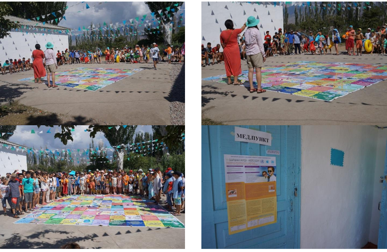
7)Children's camp "Den Sooluk" (Issyk-Kul region, Cholpon-Ata town) Number of posters: 10