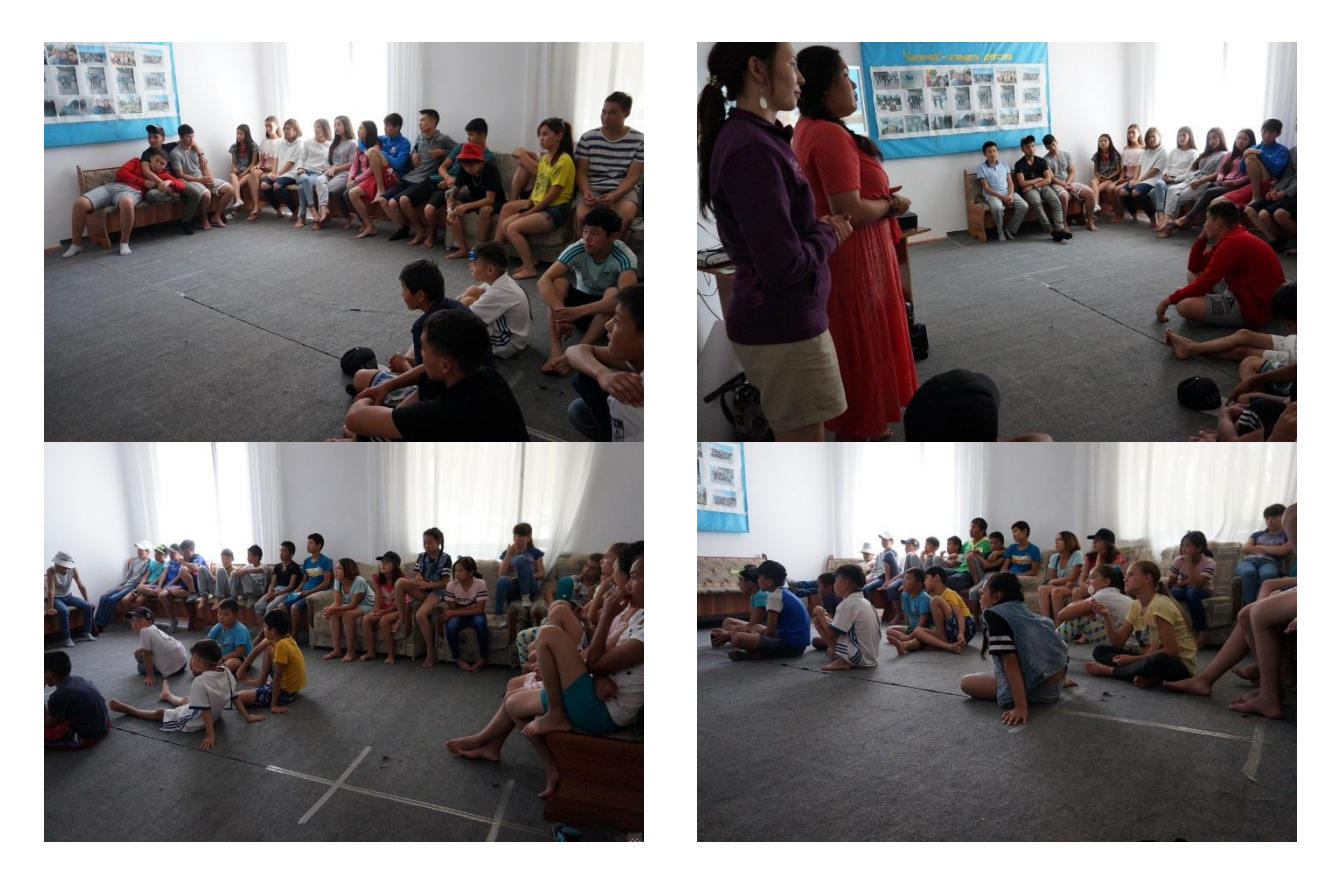
4) Children's camp "Jetigen" (Issyk-Kul oblast, Bosteri village) Number of children: 200 Number of posters: 10